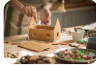
Linguistic Range and Control