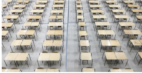
ECCE Writing Q&A