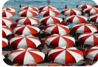
Organization and Connection of Ideas