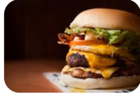
Content and Development